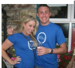
Fun and craic is the order of the day at Annascaul Beerfest