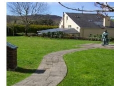
Tom Crean Memorial Garden

There will be no alcohol allowed in the Food Garden, this is the Tom Crean Memorial Garden and we would not like to sully the honour bestowed upon our event by the Tom Crean Society, who have kindly allowed us to use this space. Feel free to check out the food, pose with the statue and relax in the memory of a great Irish hero.