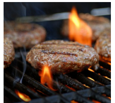
BBQ@Baldwin's: Live Band at 3 p.m. on Sunday

This year, for the first time the Annascaul Beerfest will officially run into Sunday.