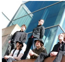
Renovator to play South Pole Inn at 4 p.m. on Saturday

All that remains now is for the rain to stay away... fat chance!