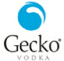
Gecko Vodka: A Premium Imported Nordic Vodka

We know that some of you like to taste a few of the beers but prefer a lighter option after a while. Therefore we are proud to bring GECKO to the Randy Leprechaun. This is a premium imported Nordic vodka. Expect a limited amount of cocktail specials on the night!