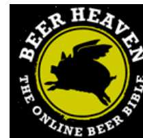
World Beers brought to you by beerheaven.com

The world beers are brought to you by Beer Heaven and include brands from central Europe, the Far East as well as from the Antipodes.